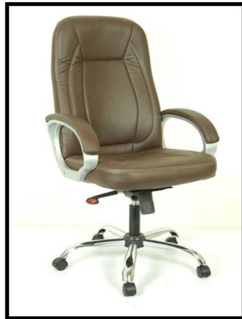
High Back Office Revolving Chair