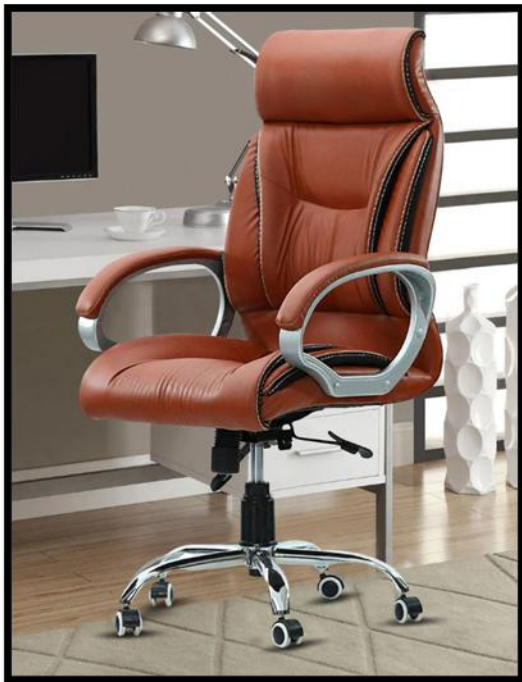
Executive Revolving Chair