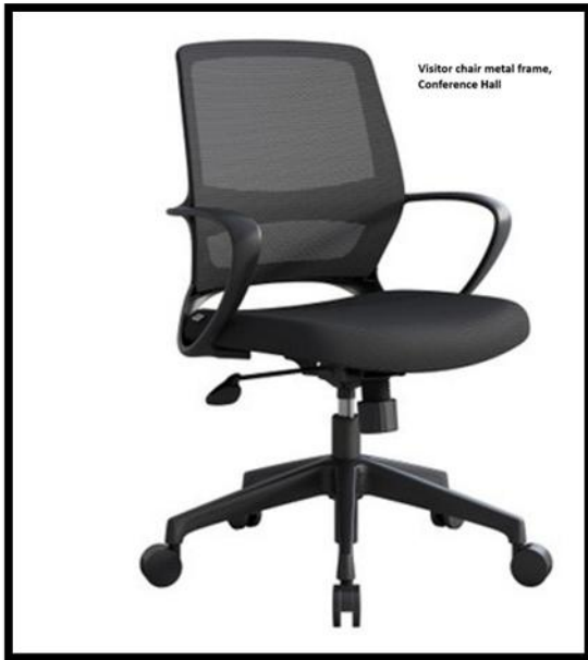
Medium Back Office Visitor Revolving Chair